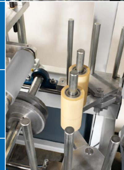
...and thus adapted to the respective profile width with lightning speed.