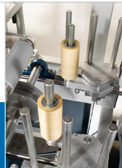
Sophisticated mechanism: The three side guide rolls allow to be adjusted in parallel with one deft movement only...